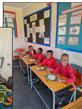
Enjoying the fruit of all their hard work.