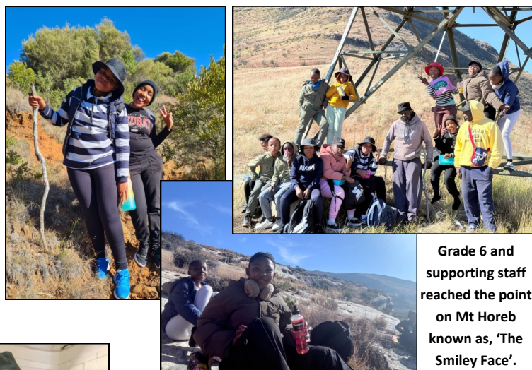
Grade 6 and supporting staff reached the point on Mt Horeb known as, 'The Smiley Face'.

The 16th of June is ' Youth Day ', a public holiday in SA. This commemorates the role young people played in the national struggle against Apartheid. Grade 6 chose to mark the day by hiking up Mt Horeb, the mountain that overlooks the school site. This is no mean achievement. They started at 1800m, the height of the town of Clarens, climbing to approximately 2400m. They also used the event to raise funds for their Grade 6 residential trip, later in the year. It was a very strenuous, character building day! Well done Grade 6!