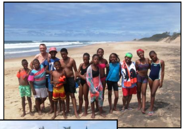
On the beach, a visit to Mini-Town and Ushaka Marine World

Grade 6 Trip to Durban - Earlier this term Grade 6 had the privilege of going on a five day trip to the coast of Durban. As in previous years, they stayed at the Natalia Centre in Amanzimtoti, which is just behind the beach. They visited Ushaka Marine World and the Wet and Wild water park, a crocodile and snake sanctuary, Mini-Town, a model village, and Howick Falls on the return journey. A wonderful time was had by all.