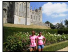
At Arundel Castle