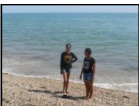
At Bognor Regis